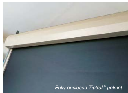
Fully enclosed Ziptrak® pelmet