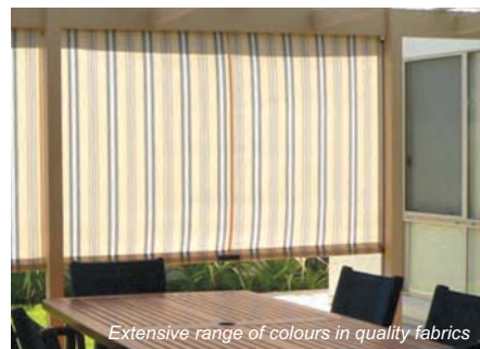
Extensive range of colours in quality fabrics

Discover a simpler way to shade and protect your outdoor way of life.