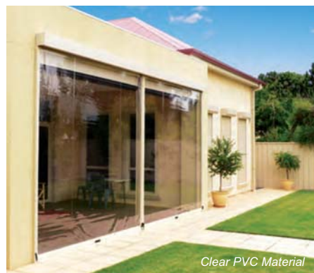
Clear PVC Material